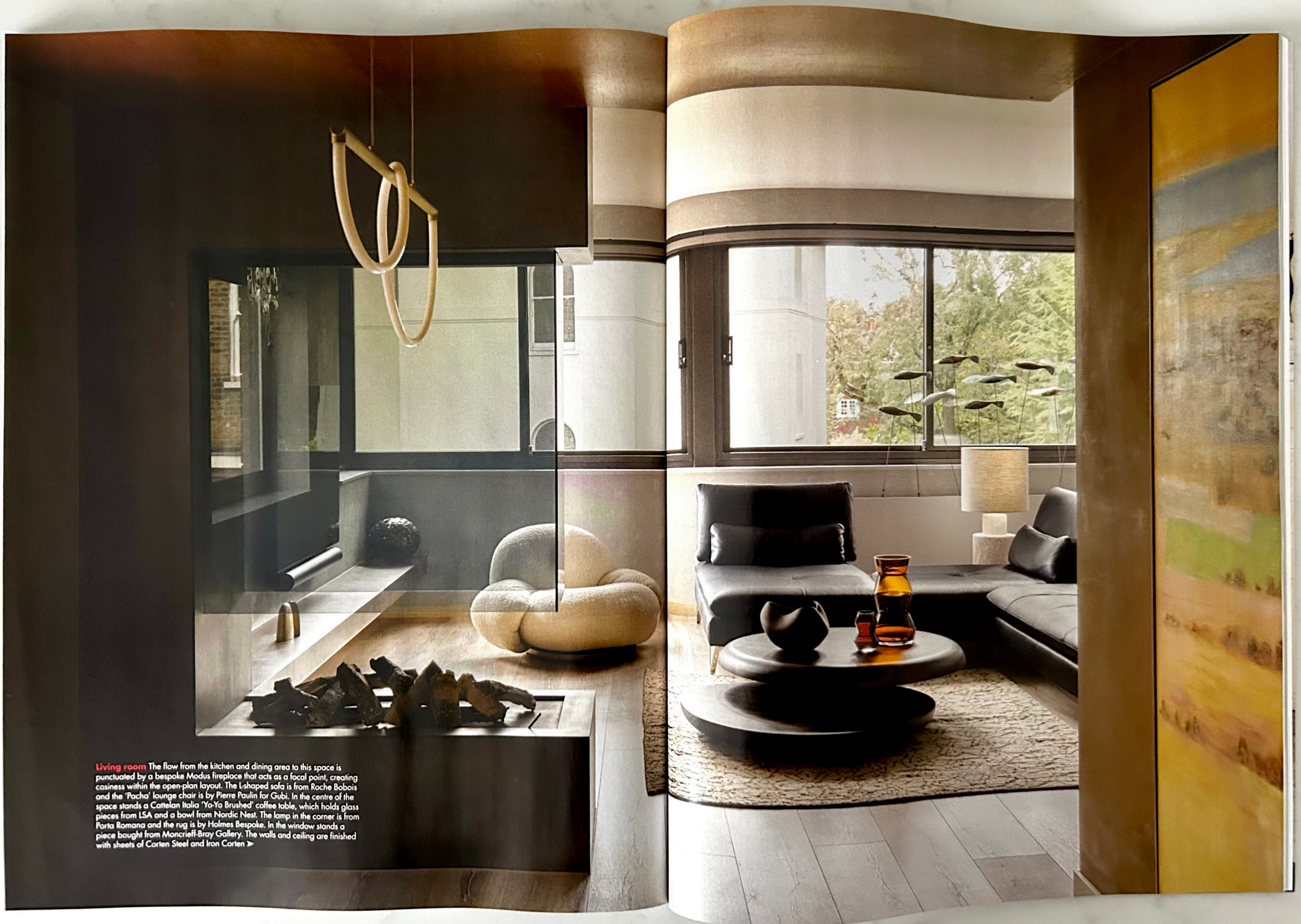
Living room The flow from the kitchen and dining area to this space is punctuated by a bespoke Modus fireplace that acts as a focal point, creating cosiness within the open-plan layout. The L-shaped sofa is from Roche Bobois and the 'Pacha' lounge chair is by Pierre Paulin for Gubi. In the centre of the space stands a Cattelan Italia 'Yo-Yo Brushed' coffee table, which holds glass pieces from LSA and a bowl from Nordic Nest. The lamp in the corner is from Porta Romana and the rug is by Holmes Bespoke. In the window stands a piece bought from Moncrieff-Bray Gallery. The walls and ceiling are finished with sheets of Corten Steel and Iron Corten >